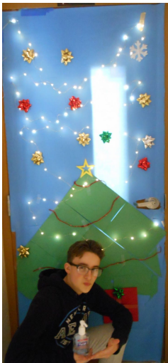
7th & 8th

Christmas is almost here. Even before Thanksgiving, you may walk into a grocery store or the mall and notice the Christmas music playing. The music of the season kicks in rather early but now we are getting into the Christmas spirit! We have asked our class and a majority of the school what their favorite Christmas jingles were. We gave them a choice of six popular Christmas songs and narrowed the answers down to the top three. Jingle Bells rocked in third place, but Jingle Bell Rock took a decisive second. The top Christmas jingle was Sleigh Ride . The author's personal favorites were Jingle Bell Rock and All I Want For Christmas Is You but we conceded the victory to the winning song, Sleigh Ride and all agreed that Christmas songs are a great and fun way to spread the Christmas spirit.