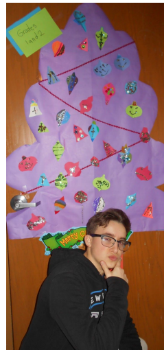
1st & 2nd