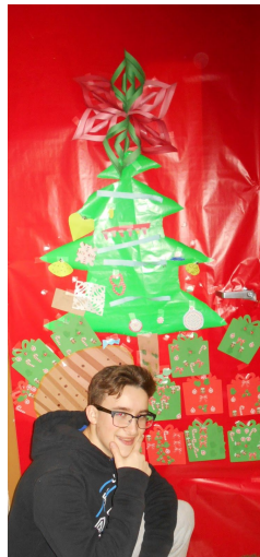
3rd & 4th