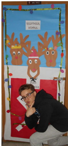
5th & 6th